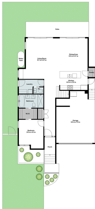
First Floor & Site Plan