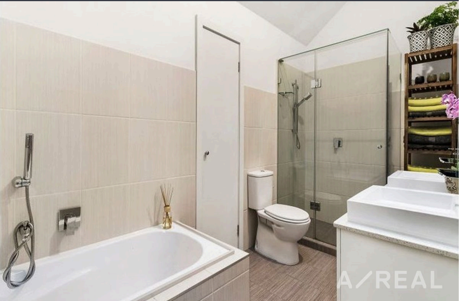
4/8 GREGORY STREET, OAK PARK