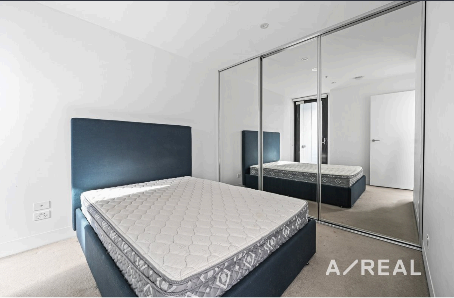
UNIT TYPE 05