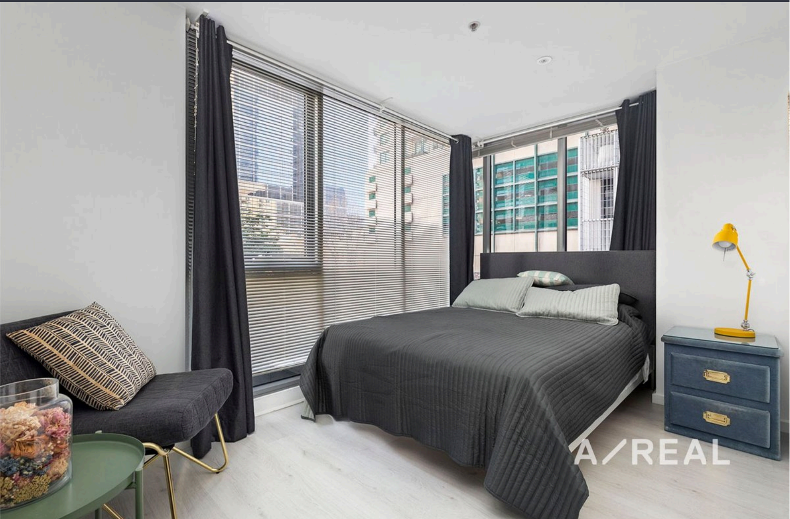
Unit 202, 8 Exploration Ln, Melbourne