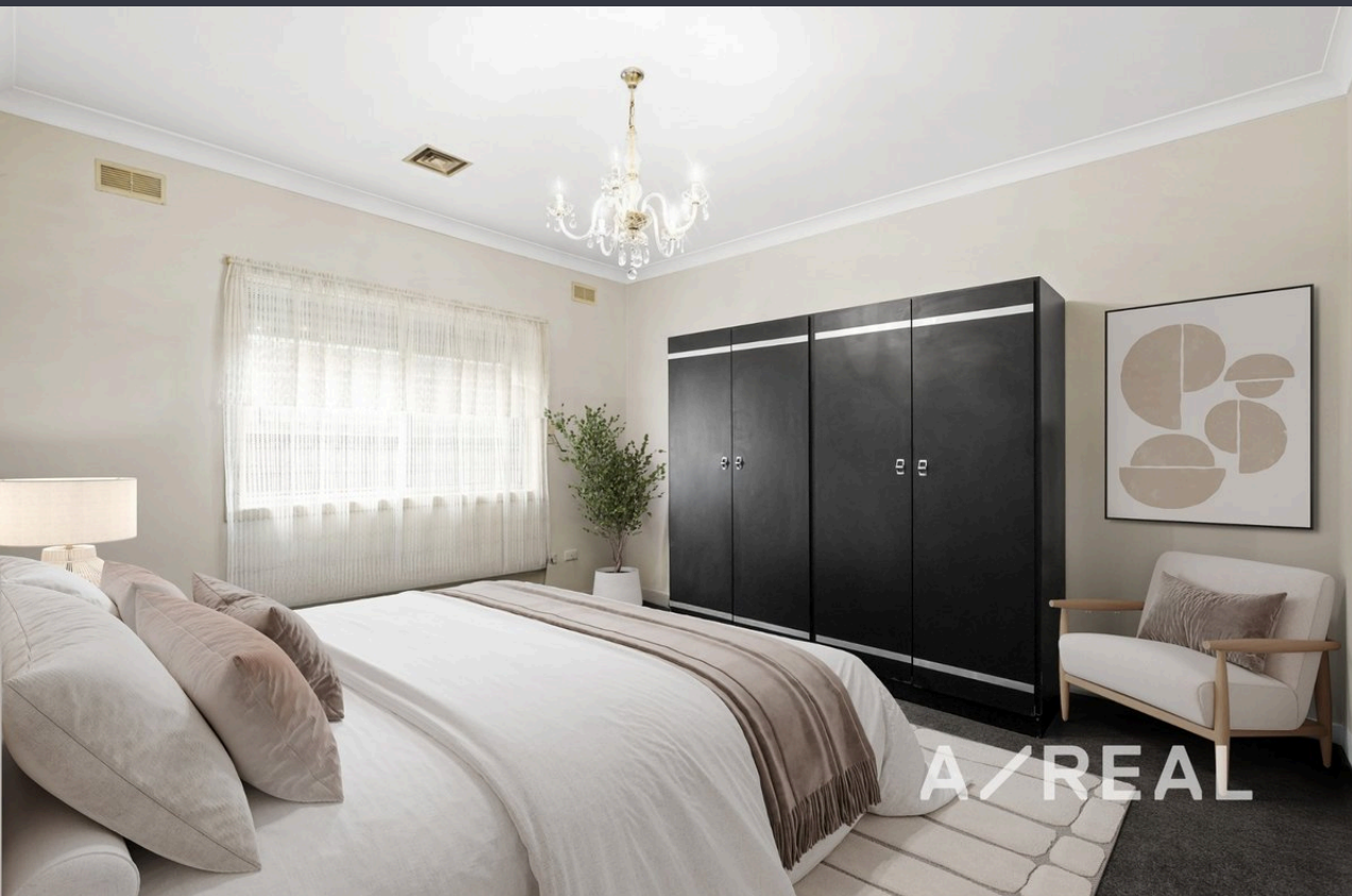
4 MERRILANDS ROAD, RESERVOIR