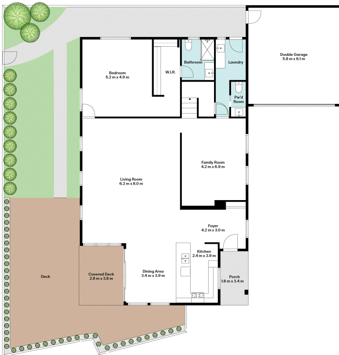
Ground Floor & Site Plan

Total Floor Area: 268m 2 Garage: 36m 2 Deck: 27m 2 Balcony: 7m 2 (approx.)