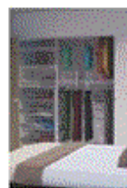
WARDROBE STORAGE SYSTEM