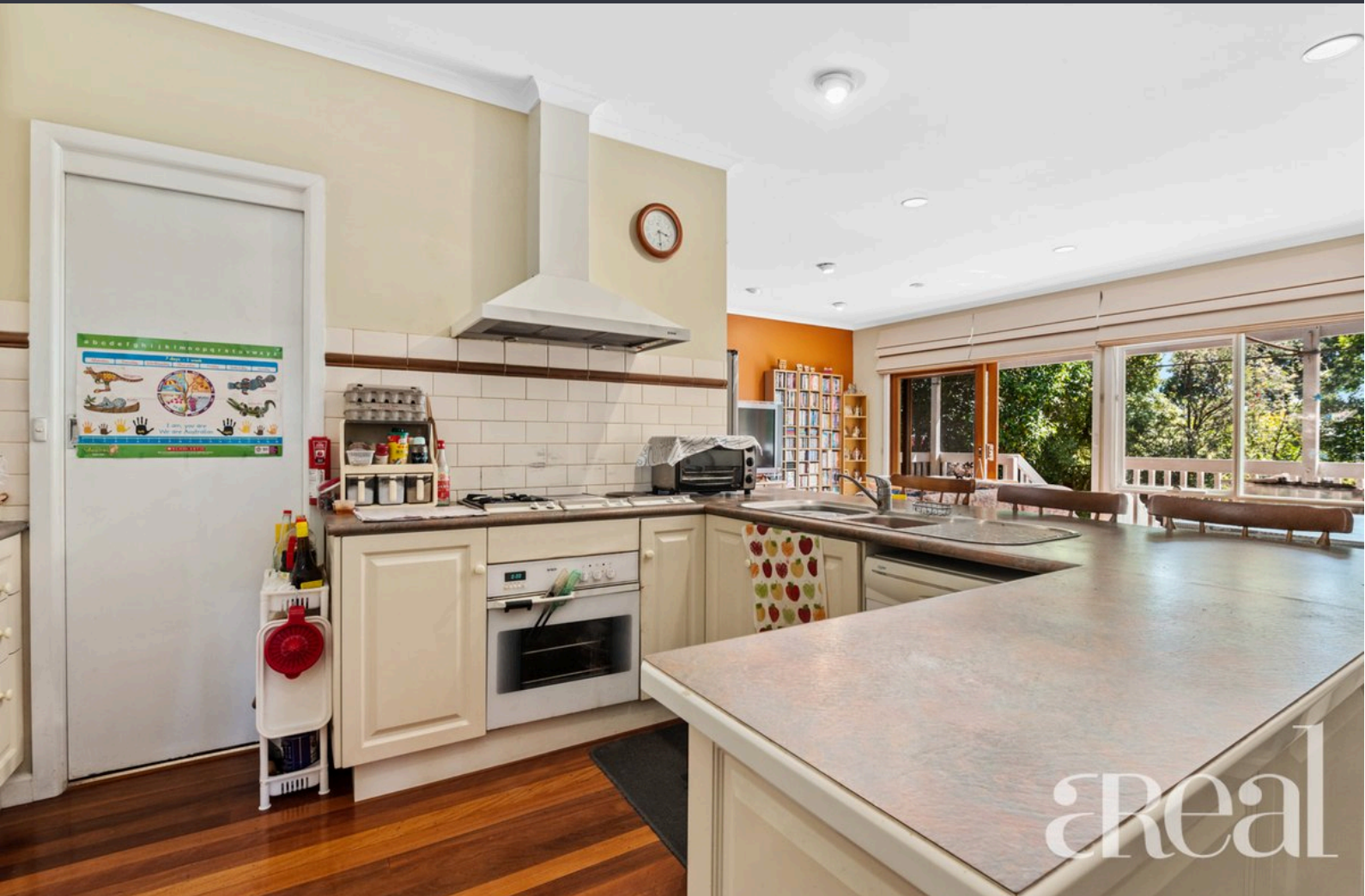
1 Aster Court, Mount Waverley