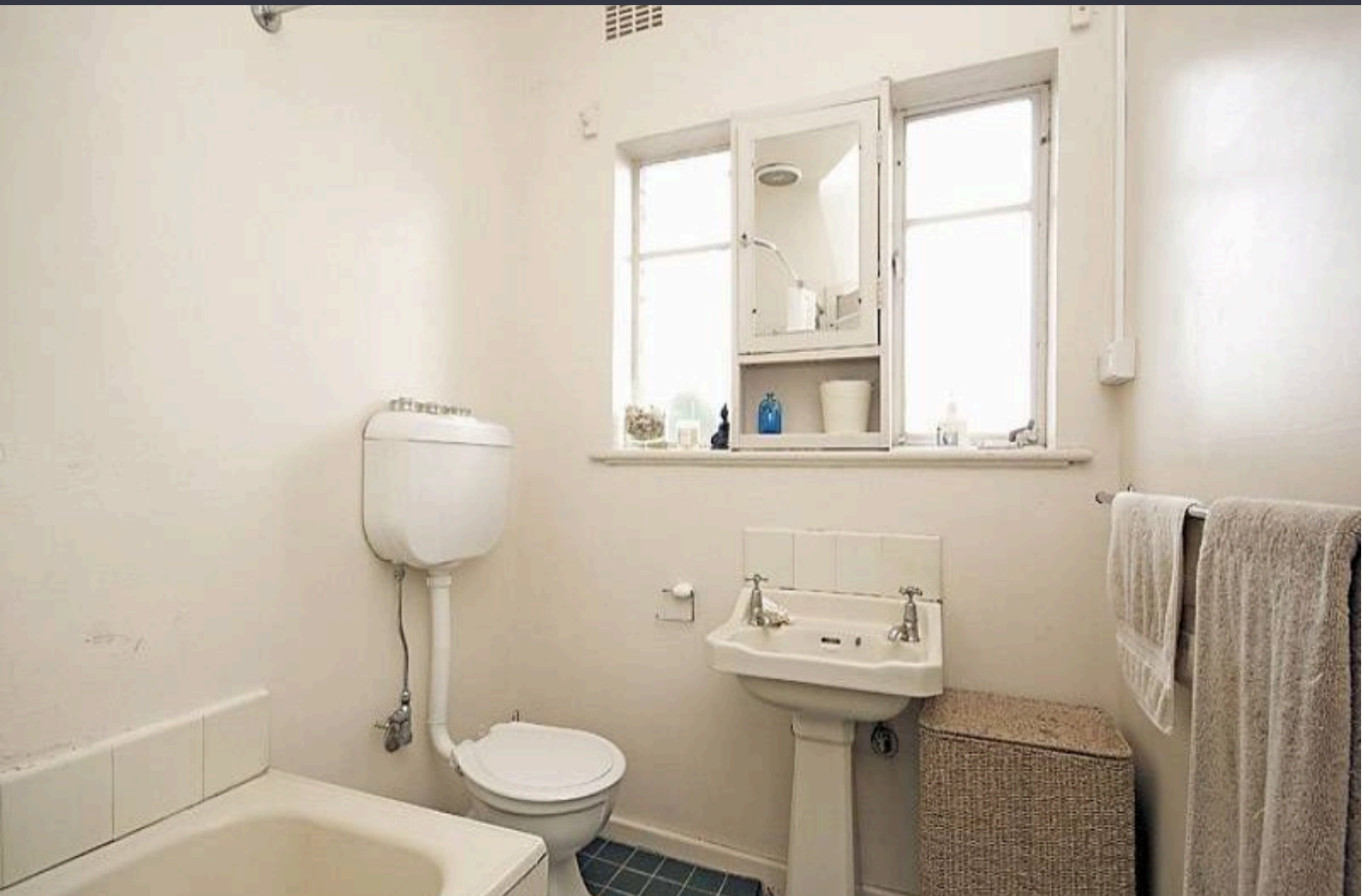
177-179 Koornang Road, Carnegie