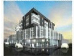
DNR BURGUNDY STREET & ROSMARA ROAD REDEVELOPMENT