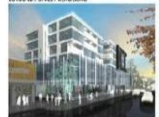
BURGUNDY STREET REDEVELOPMENT