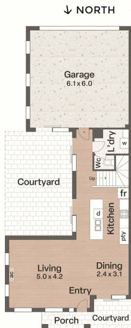
:: FLOOR PLAN Ground Floor