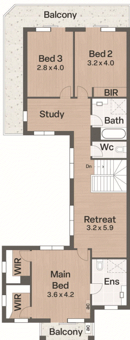
:: FLOOR PLAN First Floor