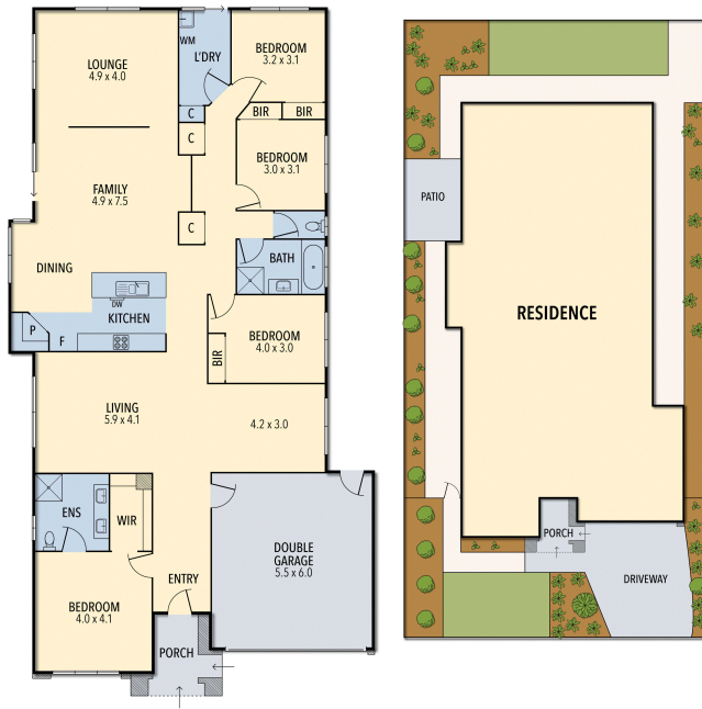
28 WERRIBEE CRESCENT, WOLLERT