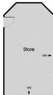
NOT IN PLACE