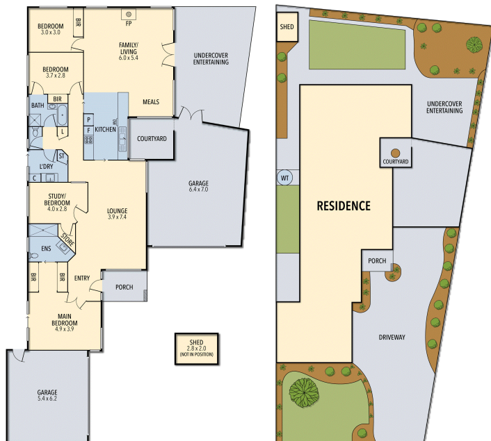
36 PULFORD CRES, MILL PARK