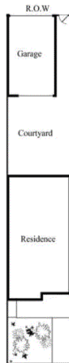
// SITE PLAN