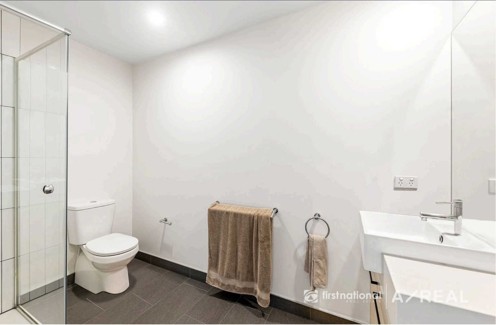
309/48 OLEANDER DRIVE, MILL PARK