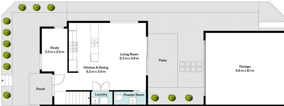
Ground Floor & Site Plan