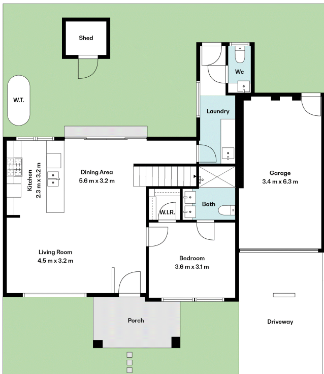
Ground Floor & Site Plan