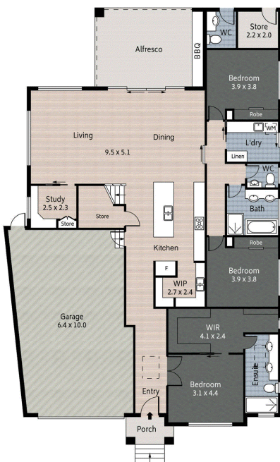
//FLOOR PLAN/Ground Floor