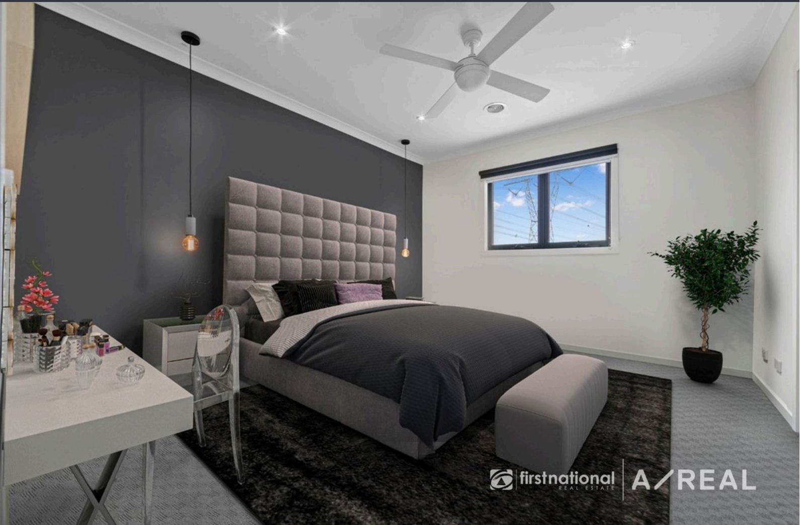
18 QUARTERHORSE DRIVE, SOUTH MORANG