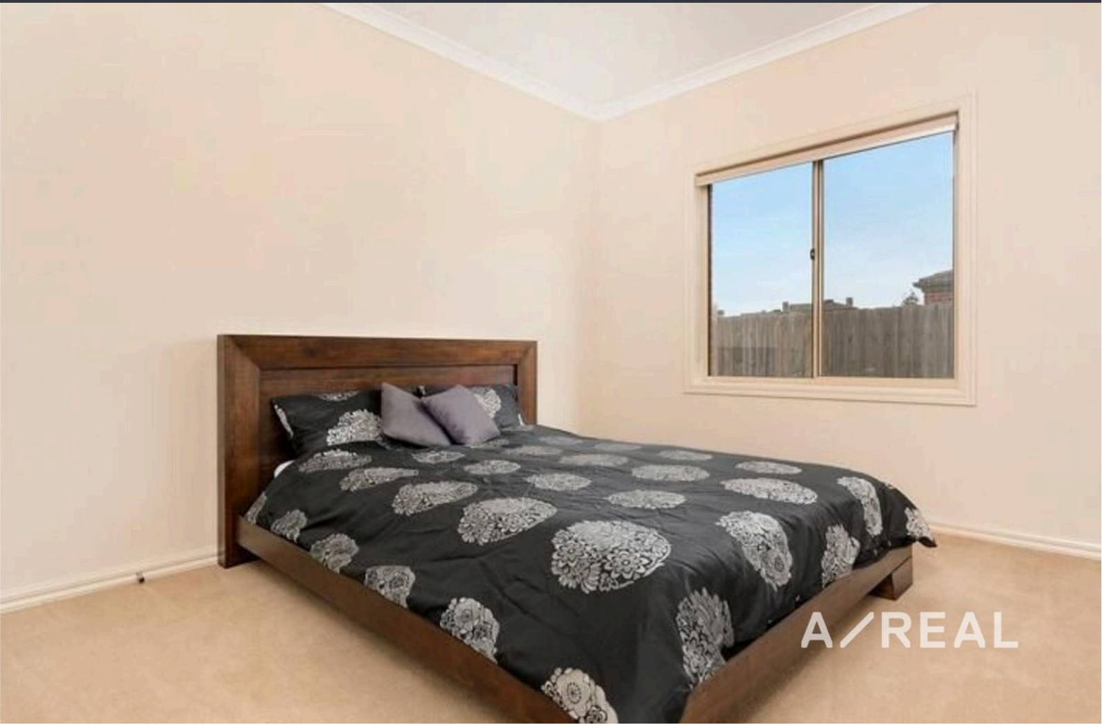
17 Ironwood Drive, Point Cook